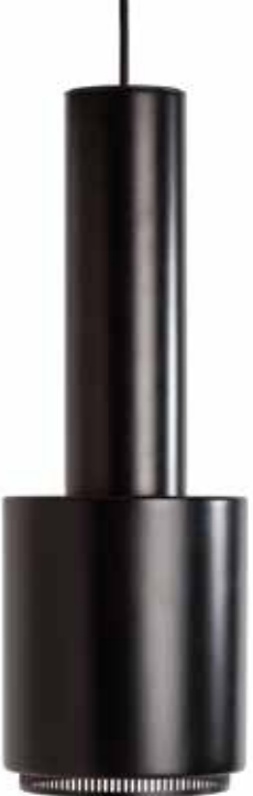
A110 LIGHT BY ALVAR AALTO $330, ARTEKFURNITURE.US.

Natural stone and tactile accessories add an organic touch to a contemporary kitchen