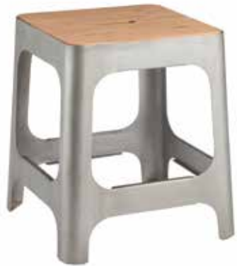
HITCH RAW 18-IN. STOOL $199, CB2.COM.