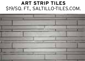
ART STRIP TILES $19/SQ. FT., SALTILLO-TILES.COM.