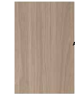
AKURUM/SOFIELUND CABINETS $159/LINEAR FT., IKEA.CA.

Smooth wood cabinets paired with glossy white anchor this contemporary look. Finish with hits of stainless steel.