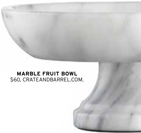
MARBLE FRUIT BOWL $60, CRATEANDBARREL.COM.

Smooth wood cabinets paired with glossy white anchor this contemporary look. Finish with hits of stainless steel.