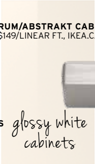
glossy white cabinets