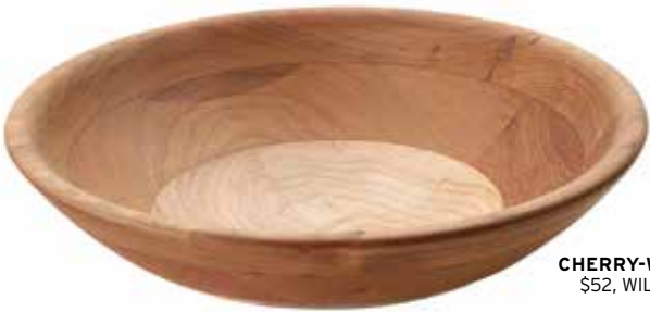
CHERRY-WOOD SERVING BOWL $52, WILLIAMS-SONOMA.COM.