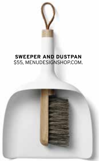
SWEEPER AND DUSTPAN $55, MENUDESIGNSHOP.COM.