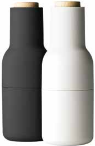
BOTTLE GRINDERS $60/SET OF 2, MENUDESIGNSHOP.COM.

Natural stone and tactile accessories add an organic touch to a contemporary kitchen